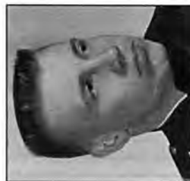
CHARLES MILTON MCCAIN Major, USMC 5 th Squadron d. 4 November 1976