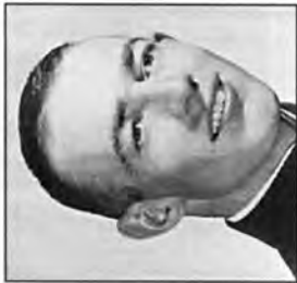
WILLIAM RENO OUELLETTE Brigadier General, ANG 13 th Squadron d. 18 July 2001